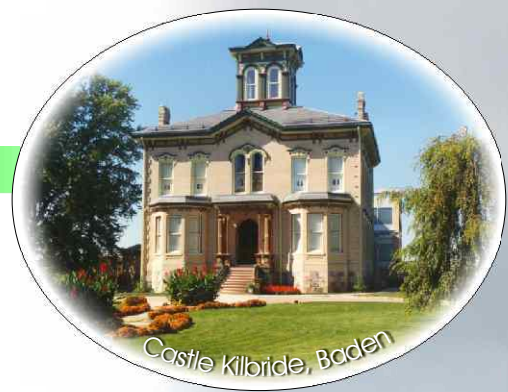
Castle Kilbride, Baden