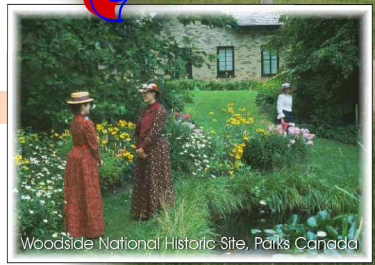
Woodside National Historic Site, Parks Canada