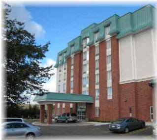
Destination Inn & Suites