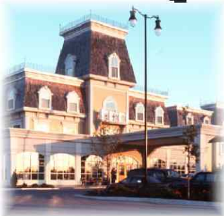
Best Western PLUS St. Jacobs Country Inn